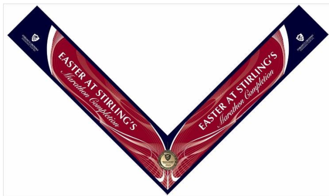
Price quoted at $66 +Art + medallion/engraving

The traditional sashes have cost approximately $20 each.