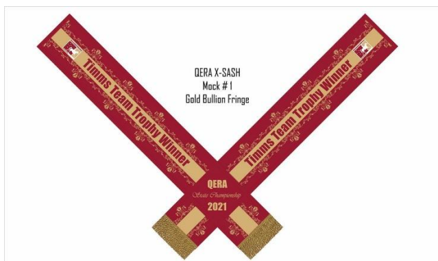
Priced quoted at $49.50 +Art